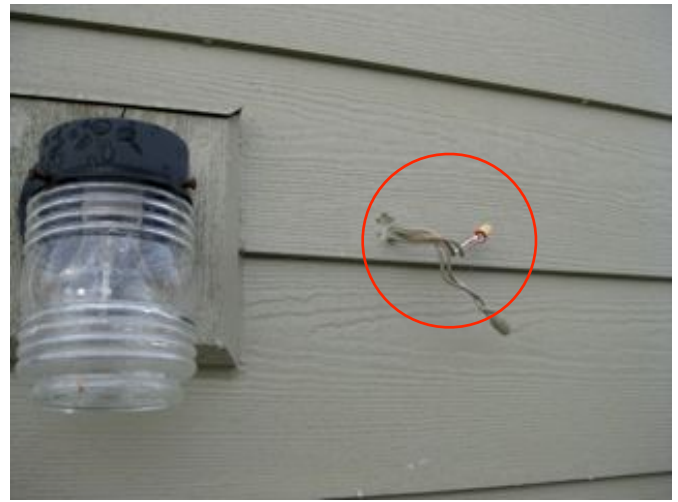
Electrical wires at roof wall