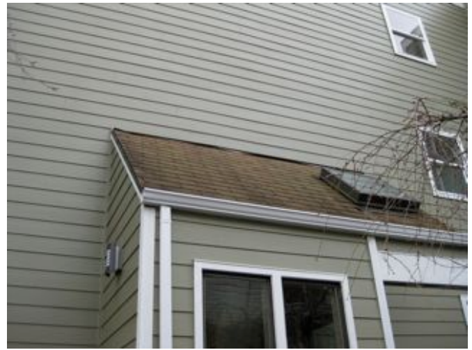
Older front roof