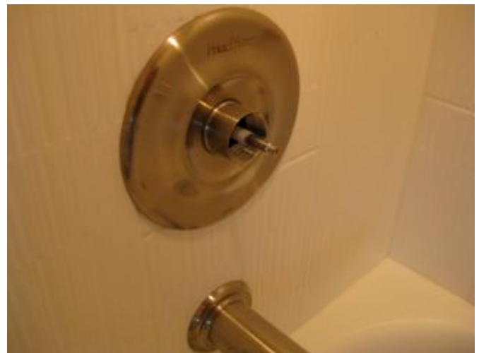
Missing tub diverter valve