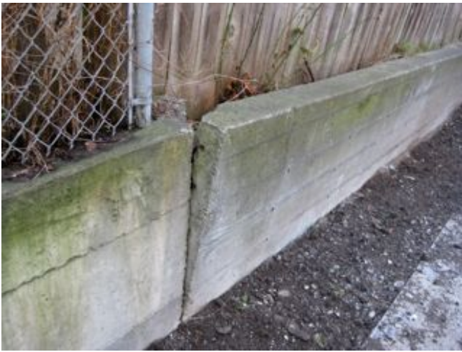
Settled retaining wall at parking