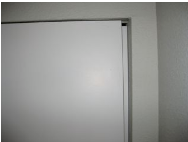
Uneven gaps at closet doors due to settling