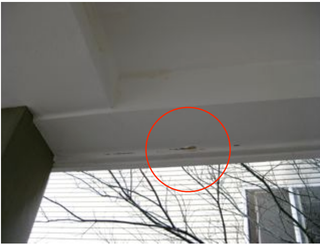
Minor leak at underside of north parking