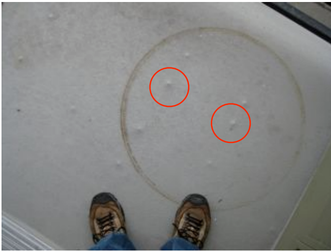
Popped nails at deck