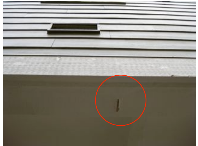
Minor leak at underside of north parking