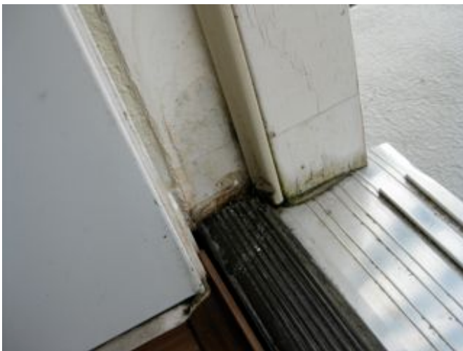
Moisture marks at deck door jamb