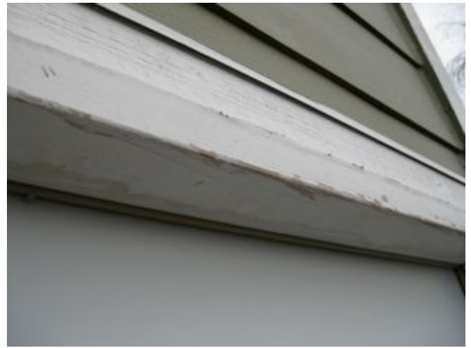
Peeled paint - primed