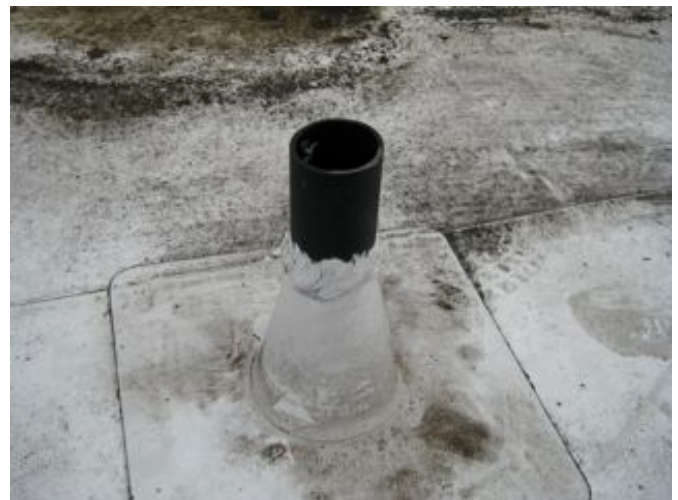
Caulk at roof penetrations