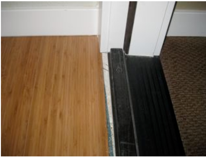
Gap at loose threshold entry