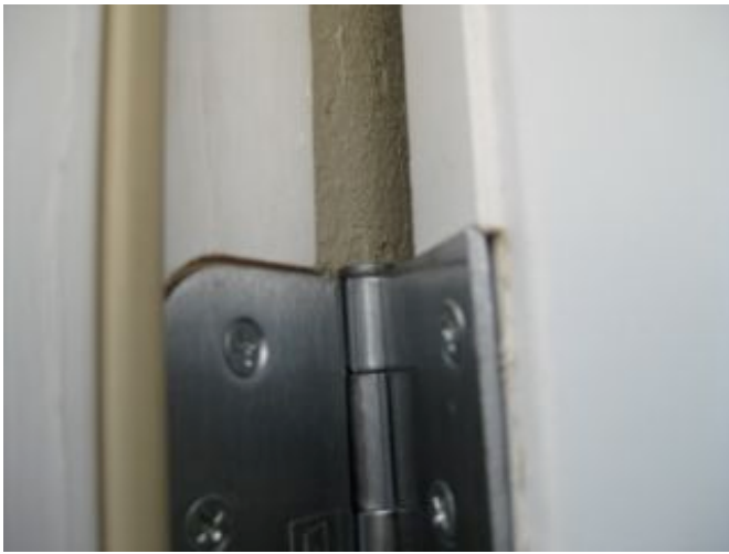
Mis-aligned door hinge