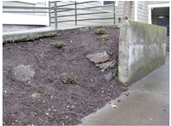
No retention at entry