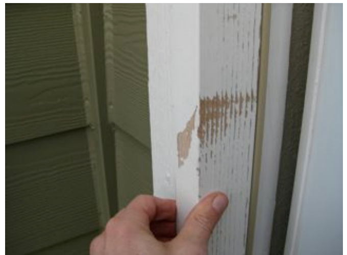
Peeled door trim