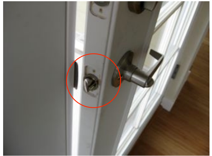
No door hasps