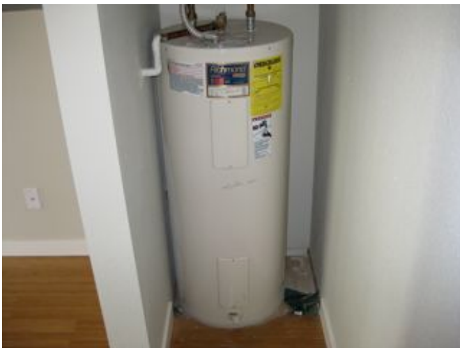
Old hot water tank