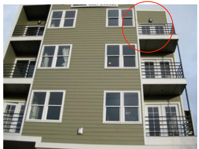
Inspected unit location