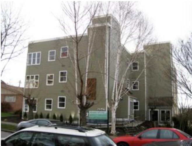
Structure of inspected unit