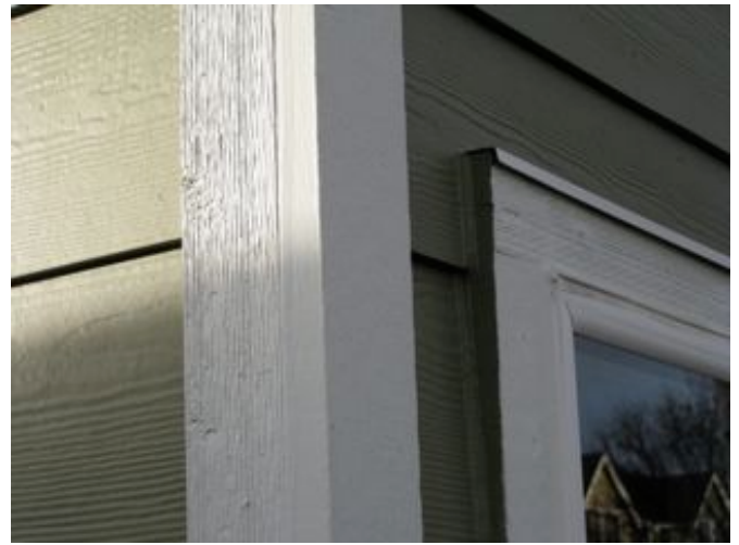
Mostly good siding details