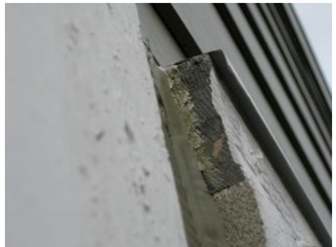
Unpainted trim ends