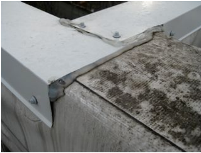
Good caulk at roof flashing