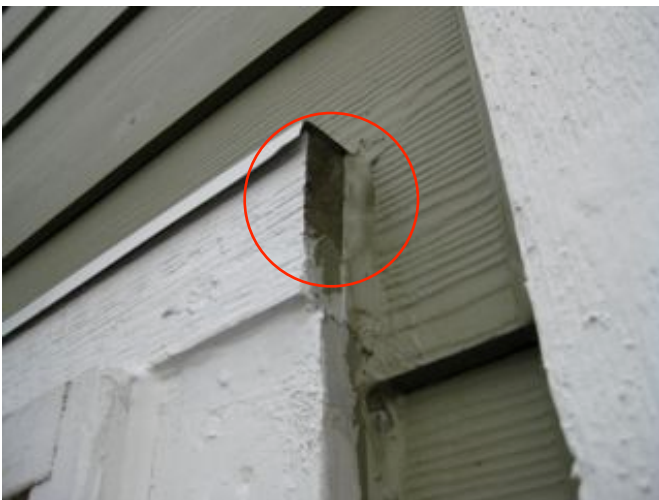
Unpainted trim ends