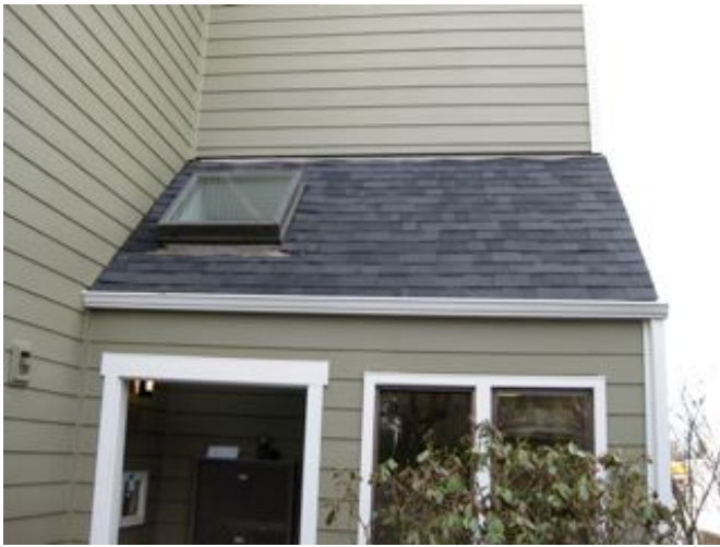
Newer front roof