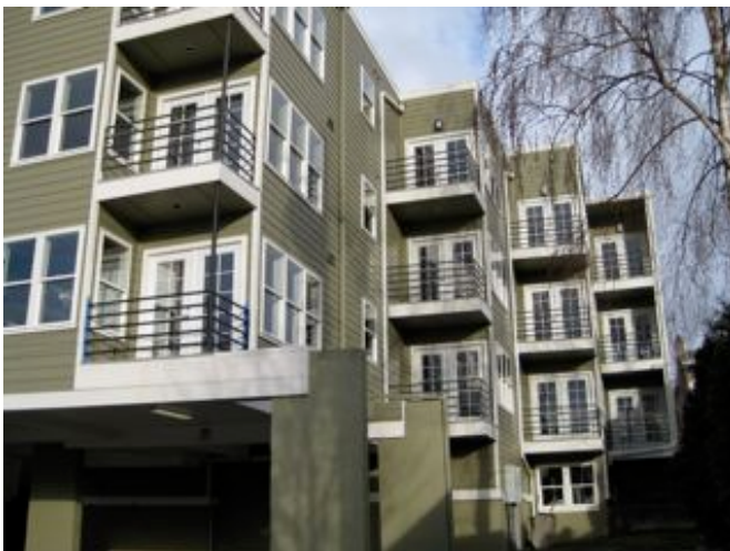
Structure of inspected unit