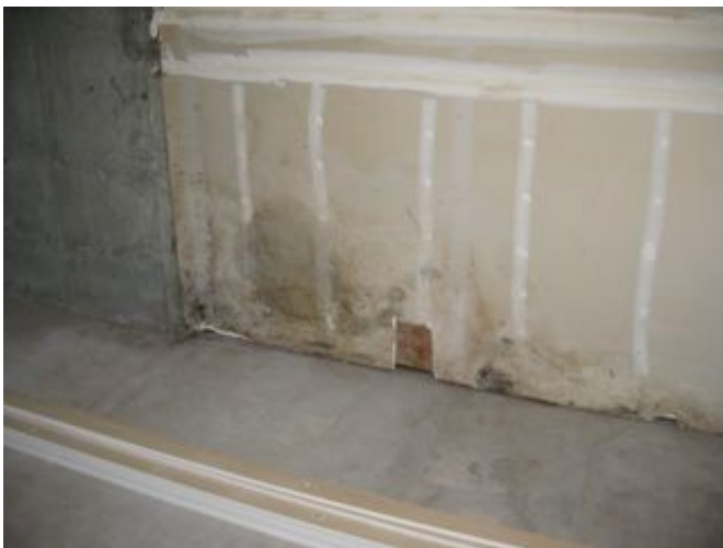
Moldy drywall at basement storage