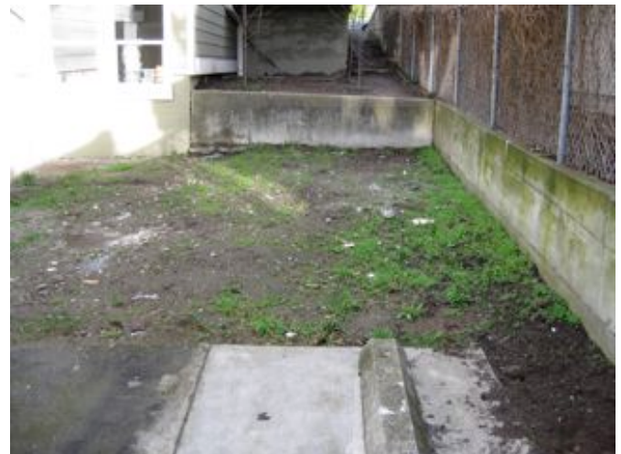
Back grounds with debris