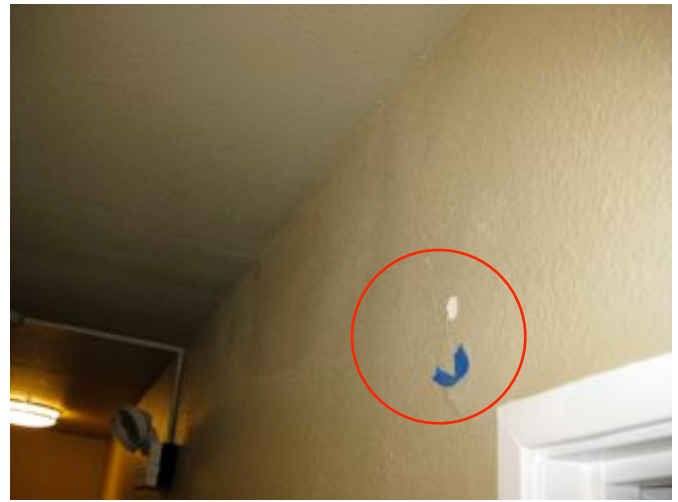
Old hall water marks