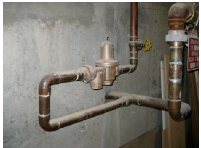
Incoming plumbing service